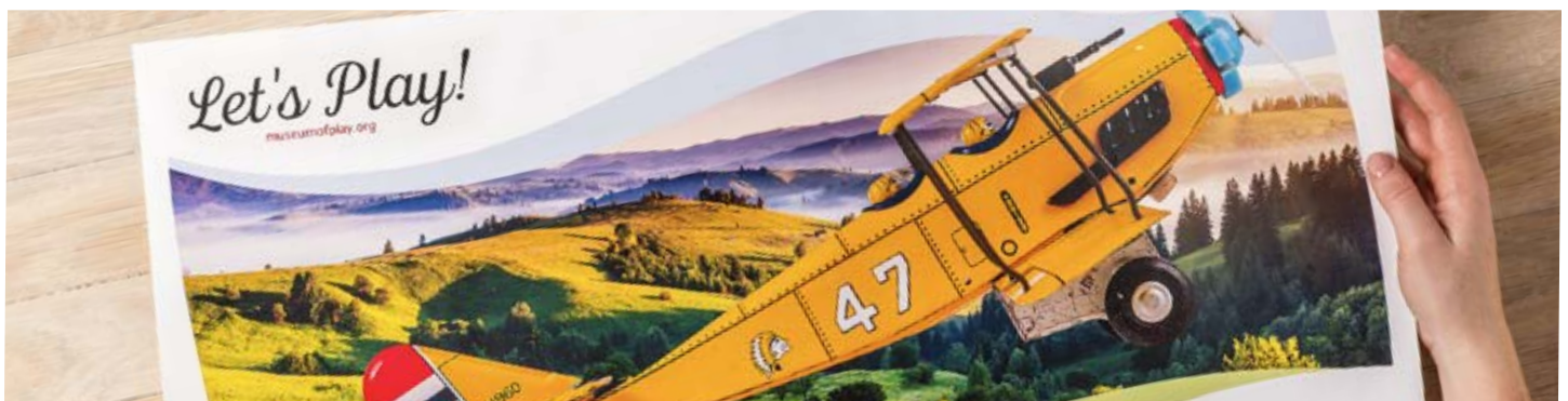
Extra-long sheet printing—maximum paper size 13 x 26" (330.2 x 660 mm)