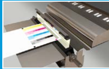
Full Width Array (FWA)

Automated Image-to-Media ensures perfect image alignment and front-to-back registration regardless of sheet size or media type—saving time and eliminating costly waste due to mis-registration or image skew.