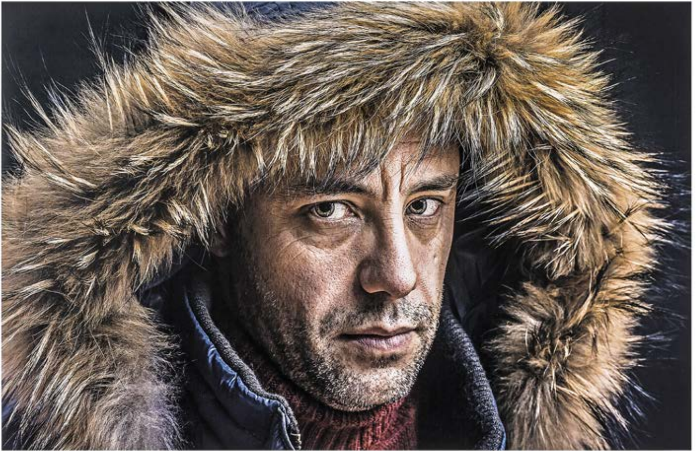
Ultra HD Resolution Technology